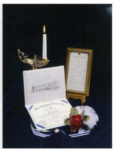
114 Years of Excellence

Graham Hospital School of Nursing will continuously achieve excellence in diploma nursing education.