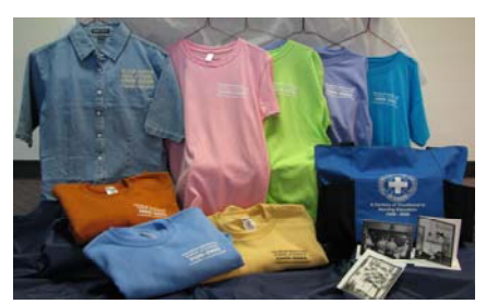
Items pictured include a denim shirt with embroidered design, ladies the shirt, sweatshirts, tote bag and historical note cards.

Items in photo to the right include GHSON backpack, alumni directory, GHSON mouse pad and the historical CD and DVD.