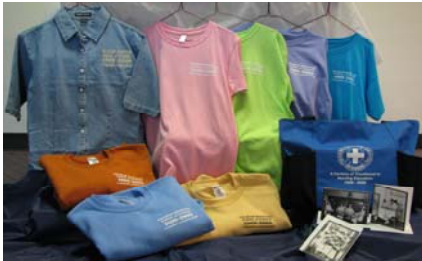
Items pictured include a denim shirt with embroidered design, ladies t-shirt, sweatshirts, tote bag and historical note cards.

Items in photo to the right include GHSON backpack, alumni directory, GHSON mouse pad and the historical CD and DVD.